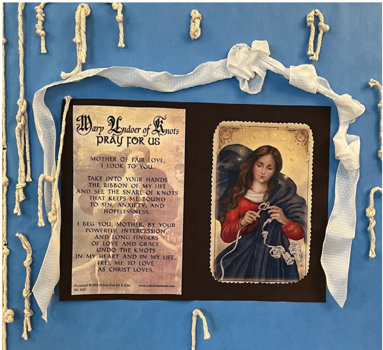
Prayer Board created for the "Mary Undoer of Knots" residents group

later created a program for residents to meet weekly to learn, reflect and engage in spiritual growth and to pray for healing.