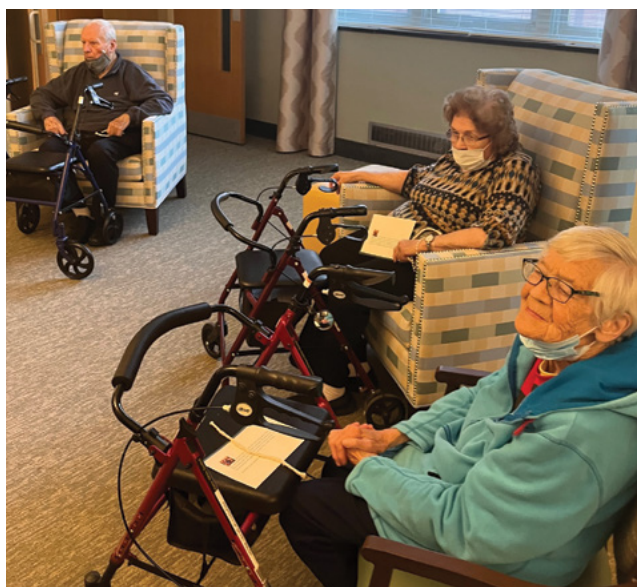
RHC Residents participating with the prayer group

We all have knots in our life. Knots that have been put in front of us, knots that have been inherited, knots that we have created. How we deal with these knots—untie them, go around them, live with them, or cut them off—are tools we all need to learn and develop. Our Blessed Mother Mary Undoer of Knots is here to help. If you